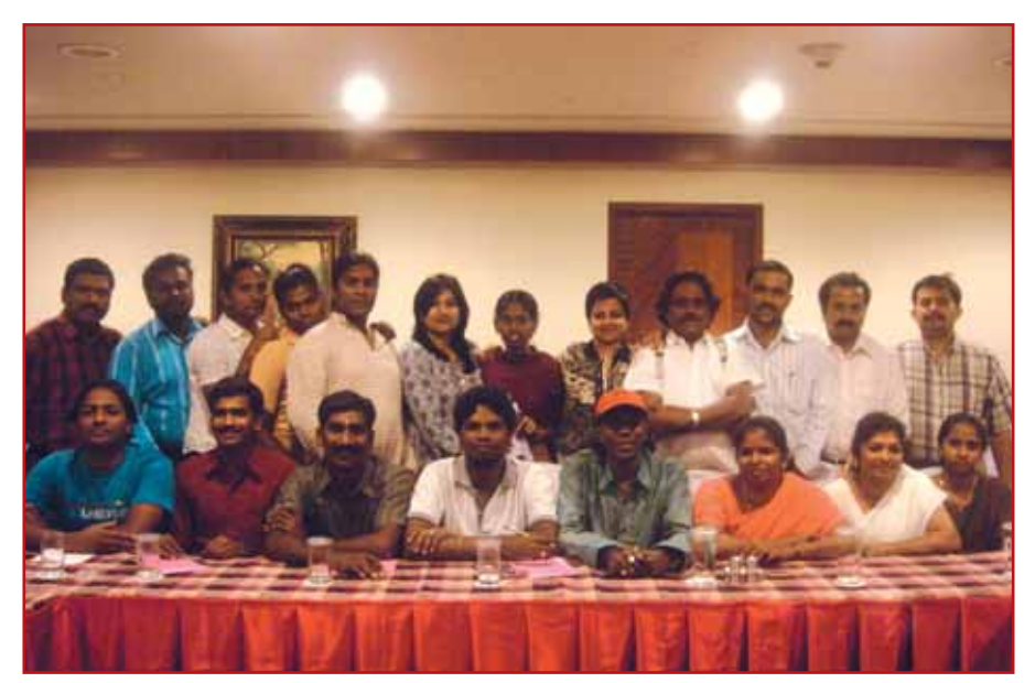
The participants at the dissemination workshop in Chennai

At the same time, efforts should be made to use innovative research methods that can ensure representative sampling of MSM and TG for surveys. There is still a large proportion of this population that is 'invisible' and does not self-identify themselves, and some are inaccessible due to rigid social structures of their community. The survey sample for this study must then, be viewed as representative of a subset of visible and self-identifying MSM and TG population who were accessible to the researchers.